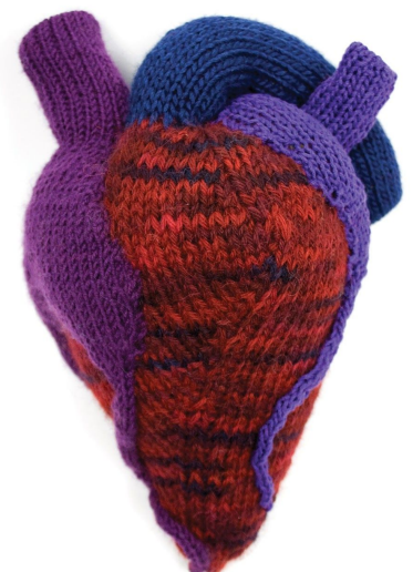
Ben Cuevas, Heart

The opening reception will include a book signing event with Twinkie Chan, and a large boutique with locally handmade, one-of-a-kind pieces, including: wall hangings, scarves, jewelry, and more.