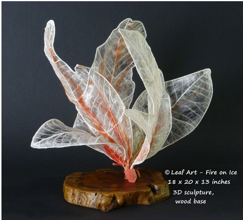
© Leaf Art - Fire on Ice 18 x 20 x 13 inches 3D sculpture, wood base